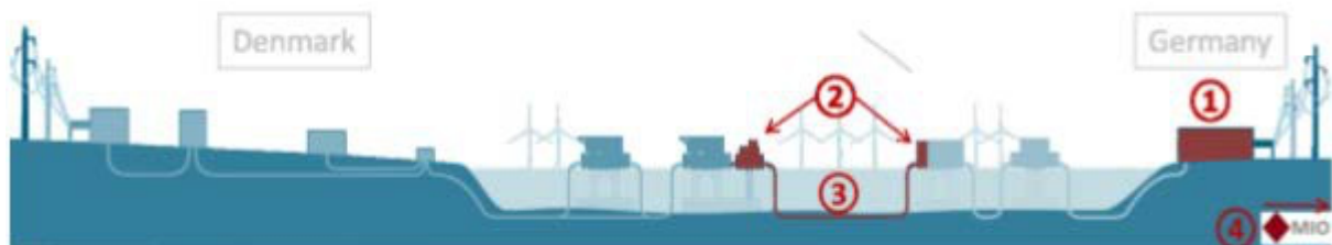
Figure 2: KF CGS Assets