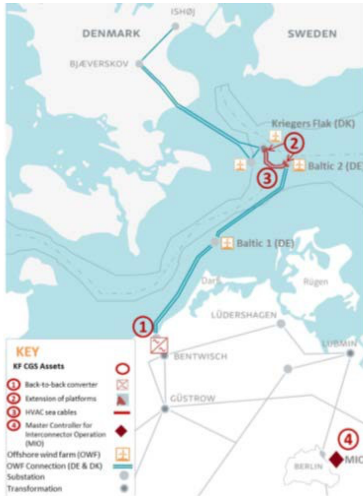
Figure 1: Map of the KF project area and main system elements