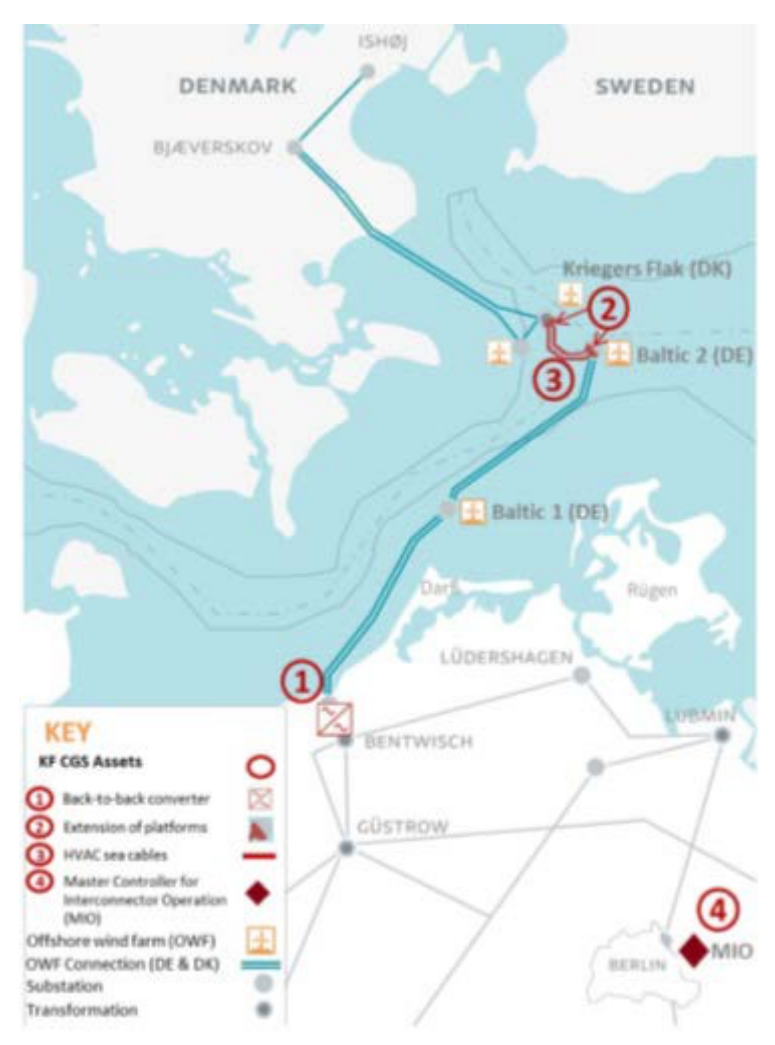
Figure 1: Map of the KF project area and main system elements

(8) Furthermore, only assets e) to h) are directly related to 'combining' the national networks. Only those assets (marked as 'KF CGS assets' in figures 1 and 2) were therefore co-financed by EU funds.